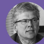
EWUOD SAKKERS Head of Unit, DG COMP European Commission