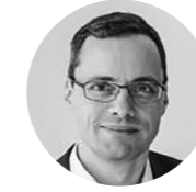
VINCENT VEROUDEN Economist European Commission