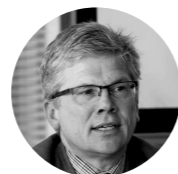
EWOUDE SAKKERS Head of Unit European Commission